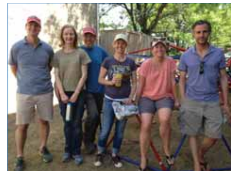
(Above and right) Thank you to "Favors," a group of dedicated Neighbors Link volunteers who renovated the outside play area for the Family Center. While parents participate in educational workshops, staff and volunteers take the children to enjoy outdoor play time.