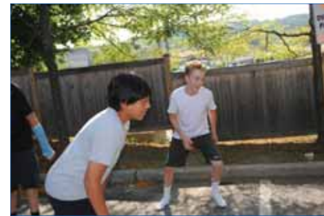
(Above left and above) Neighbors Link families enjoy our annual carnival.