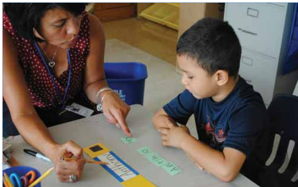
(Above and right) In partnership with Mount Kisco Elementary School, 107 elementary school children participated in our Summer Links program. The program provides academic instruction and curriculum including science, movement, nutrition, music, theater and gardening, as well as camp activities at The Boys and Girls Club of Northern Westchester. The children entering kindergarten received backpacks and school supplies donated by the Birchwood Swim Team.