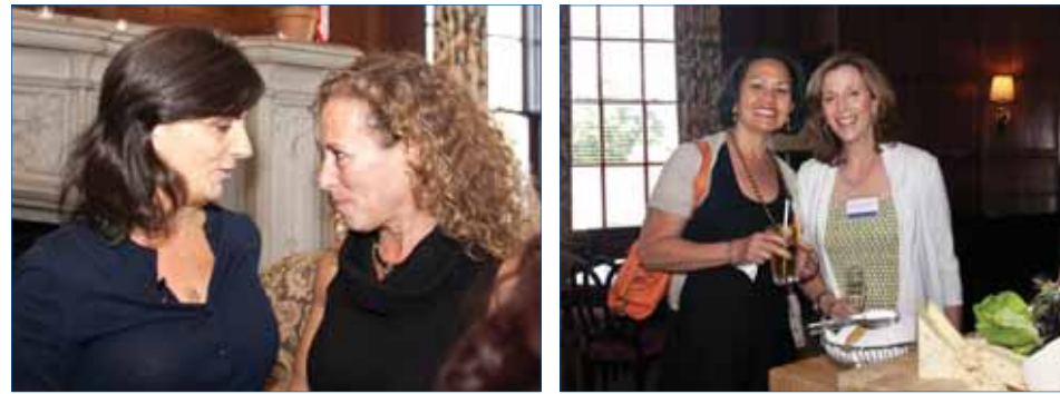
The Latin Links Presentation and Luncheon on “Women, the Immigrant Experience, and the Media” explored timely topics and engaged attendees in thought-provoking conversation.

She calls the need for immigration reform “an American issue, a major American challenge” that has not been comprehensively addressed since